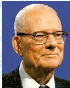
Dr. W. Edwards Deming