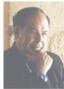
Dr. Edward de Bono