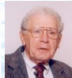
Dr. Russell Ackoff